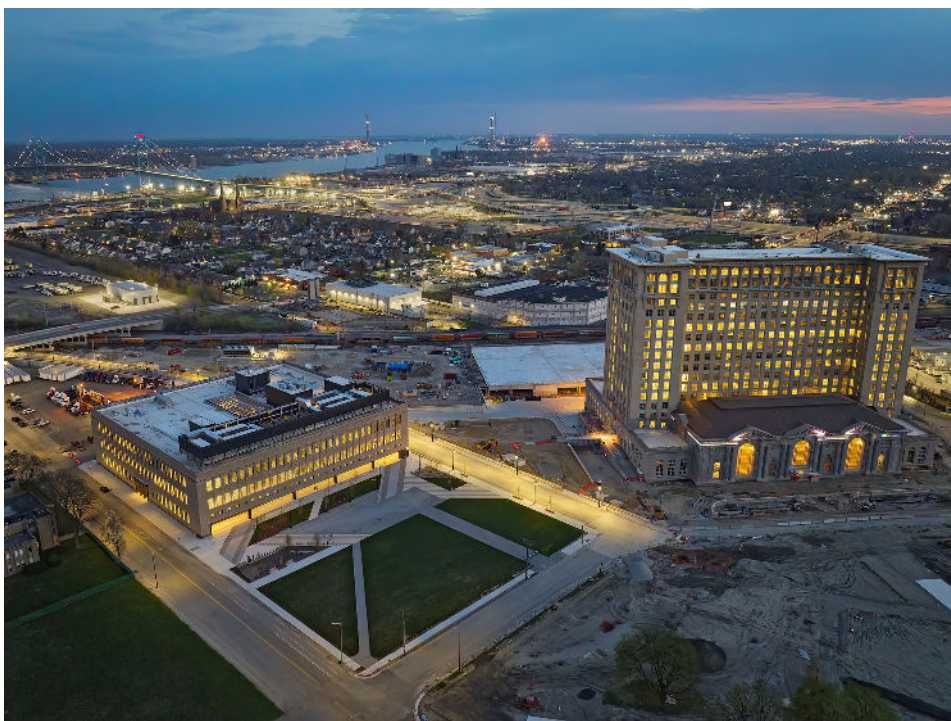
Book depository skyview angle

Michigan Central also is committed to helping more Detroit residents and others gain skills they need to join the mobility workforce through Michigan Central’s Skills at the Seams program. Entry-, medium- and high-skill levels can learn through traditional classroom-style courses, internships and fellowships, apprenticeships, and other experiential learning opportunities.